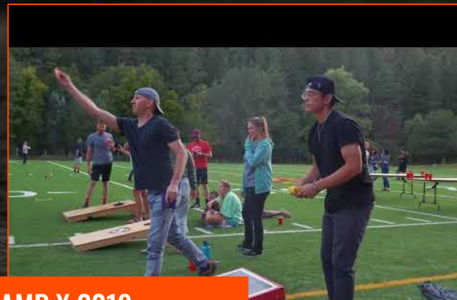
CAMP X 2019