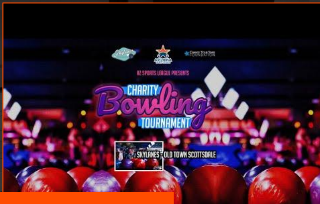
CHARITY BOWLING TOURNAMENT