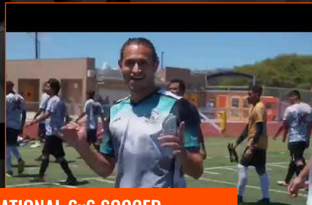
NATIONAL 6v6 SOCCER CHAMPIONSHIP - SD REGIONAL