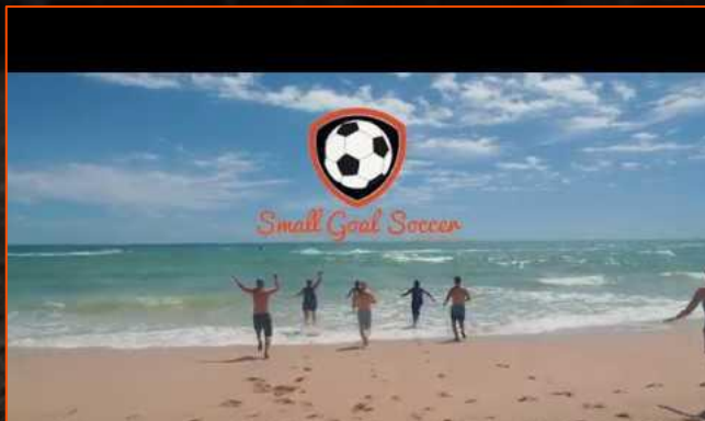
MEXICO BEACH BLAST SOCCER TOURNAMENT 2019